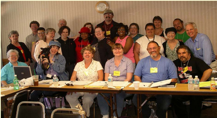
Leadership Training in California

The scope of our achievements of the past is an indicator of the possibilities for our future.